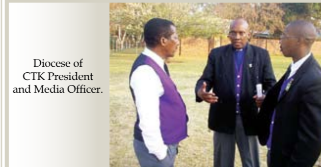
Diocese of CTK President and Media Officer.