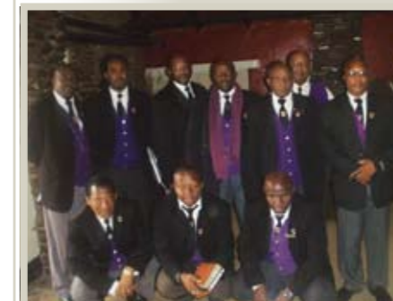
Diocesan Media Officers